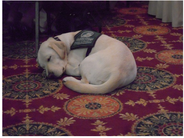
One Tired Pup!