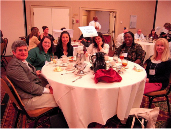
Contra Costa County